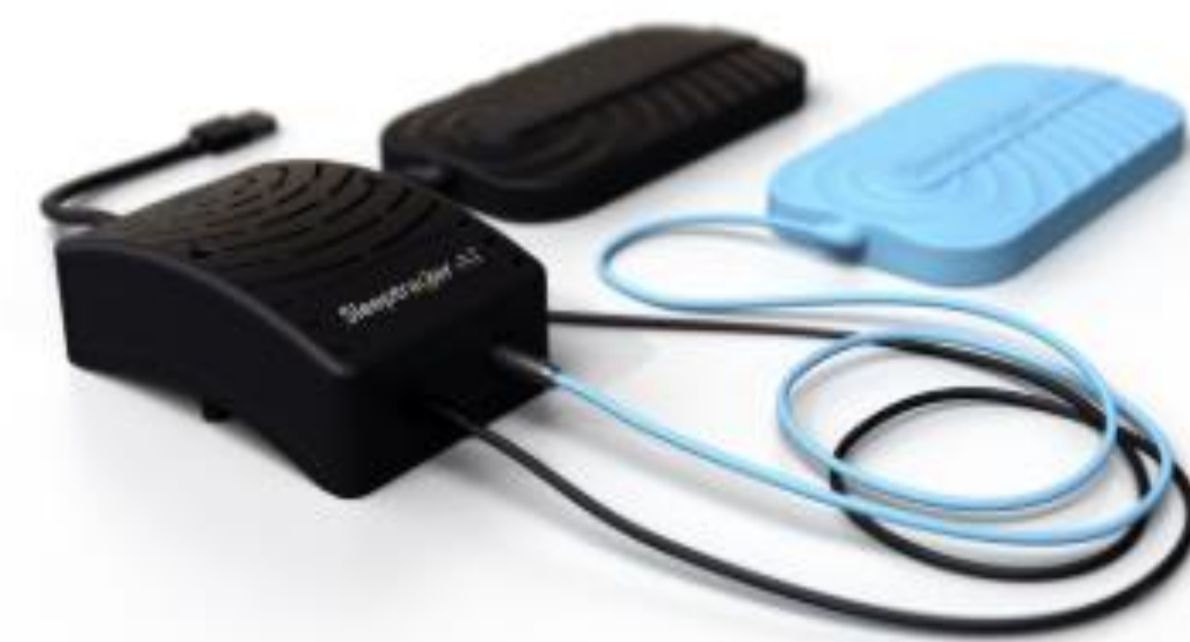
The Sleeptracker-AI Monitor under-mattress device